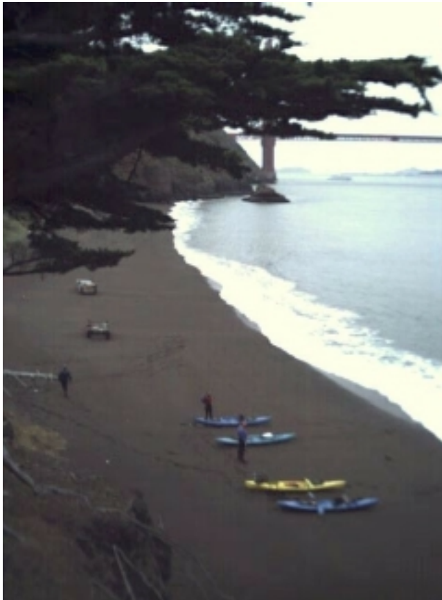
Beached at Kirby Cove