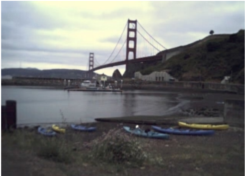
Prior to Launching at East Fort Baker